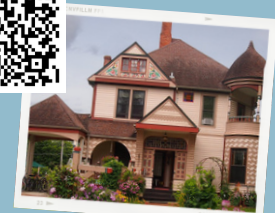
Scanlon House | Lanesboro

Scan the code to find a list of the 36 properties in Fillmore County on the National Register of Historic Places.