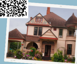
Scanlon House | Lanesboro